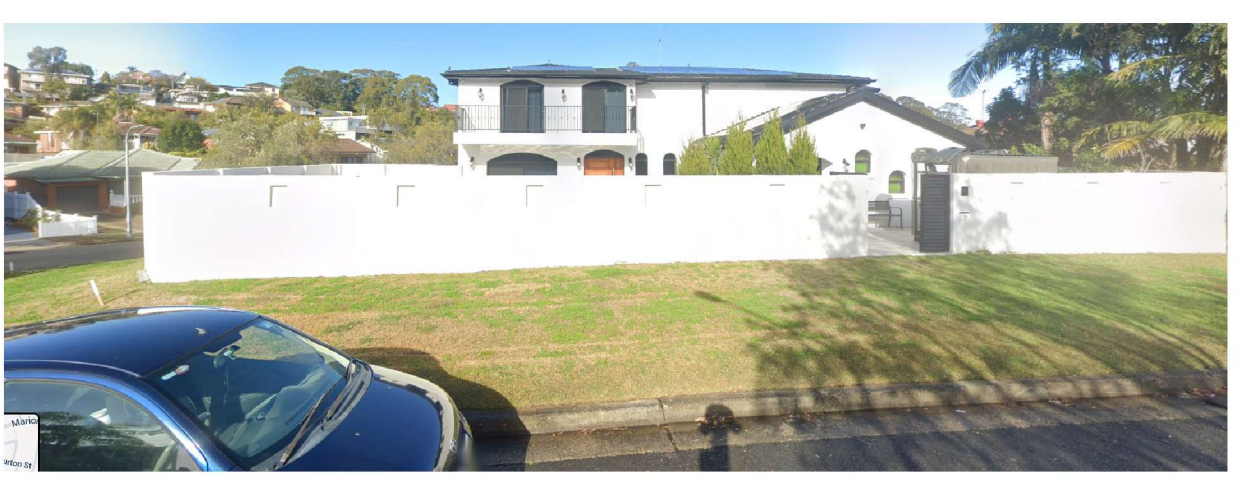
WALL FINISH TO MATCH EXISTING WALL (WHITE RENDER FINISH)